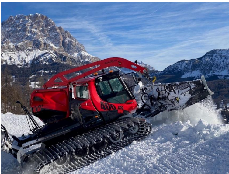
The PistenBully 400 ParkPro – equipped with a 6-belt KombiPlus Track with STEP-G aluminium profiles.