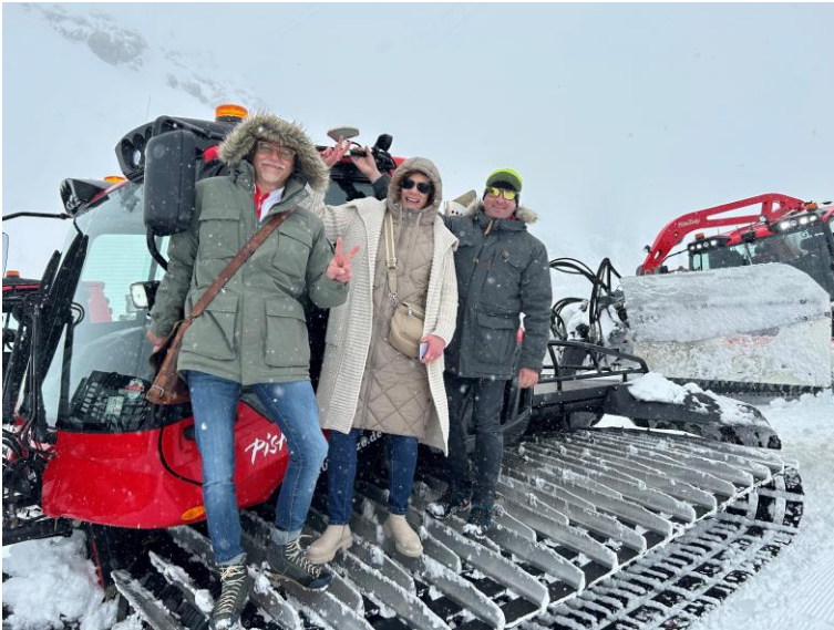
STEP-G was part of the eventful Kässbohrer Supplier Day on the Zugspitze.

More information is available at www.step-g.com , www.kaessbohrerag.com and www.pistenbully.com .